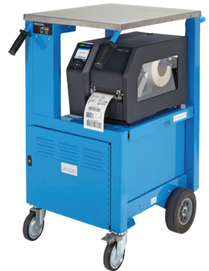
Powered Mobile PrintCart