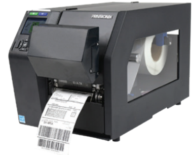
Barcode Verifier (T8000 ODV-2D)